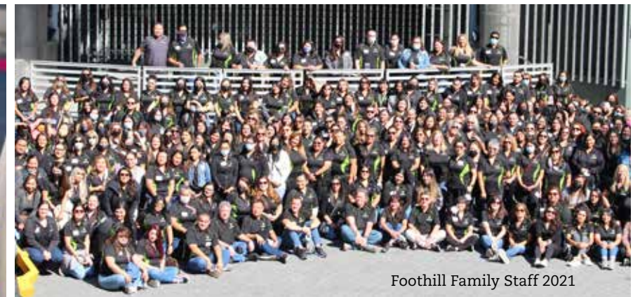
Foothill Family Staff 2021