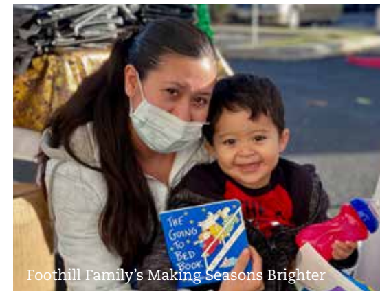
Foothill Family's Making Seasons Brighter