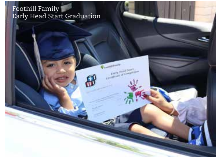
Foothill Family Early Head Start Graduation